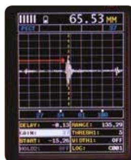
PECT Pulse - Echo Coating Mode Displays both the material thickness (PE) and the coating thickness (CT) at the same time.