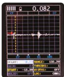
CT Coating Only Mode Displays the thickness of the coating applied to the material.